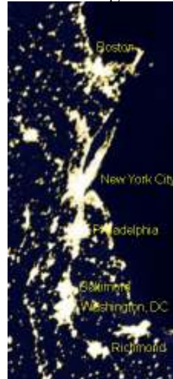
Boswash – night satellite view