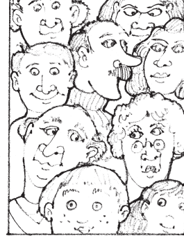
Rule by People Over Age Ten