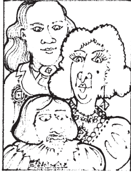
Rule by Five Smart People