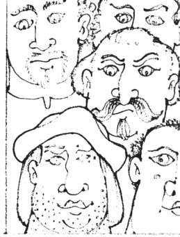
Rule by Adult Males Only